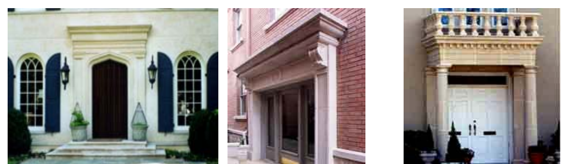
Oscan Gothic (Unit ID: 13839)