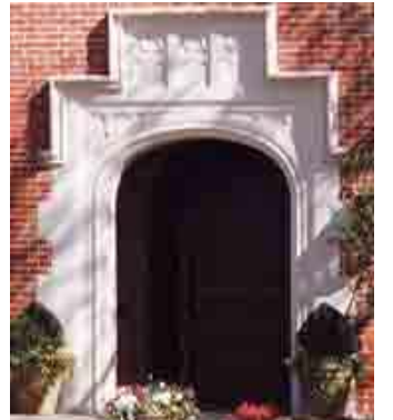
Aegean Palace (Unit ID: 13859)Castile Aragon (Unit ID: 14143)Monarch 1 (Unit ID: 122)