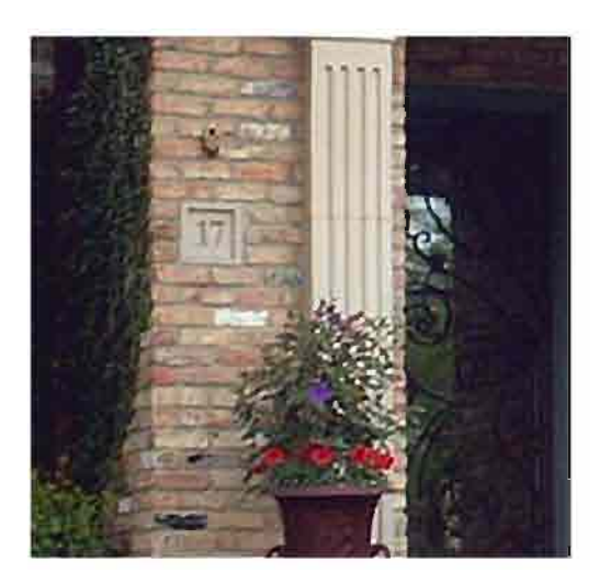
A Custom Recess Address Block with Street number. Note unpainted lettering.