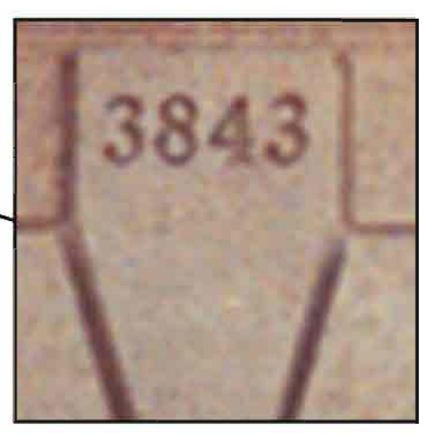
Address engraved as desired on any shape of stone. Note unpainted lettering.

Address Blocks can be custom designed to contain whatever text you require. Beyond basic Address Blocks we can produce cast stone panels that can contain any wording or image you want. See our product group,