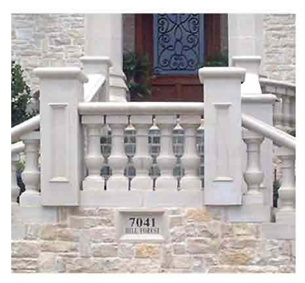
A Medallion Address Block with Street Number & Name Text finished in Black Paint.