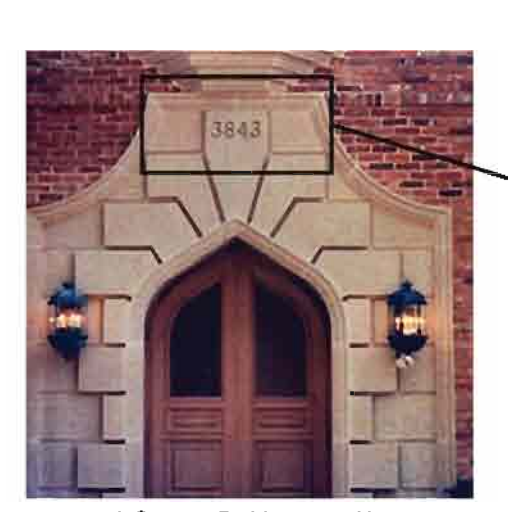
A Custom Gothic entry with recessed number. Note unpainted lettering.