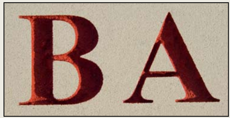
Closeup of sandblasted and painted lettering

2) Sandblasted, which is often painted afterwards, see below.