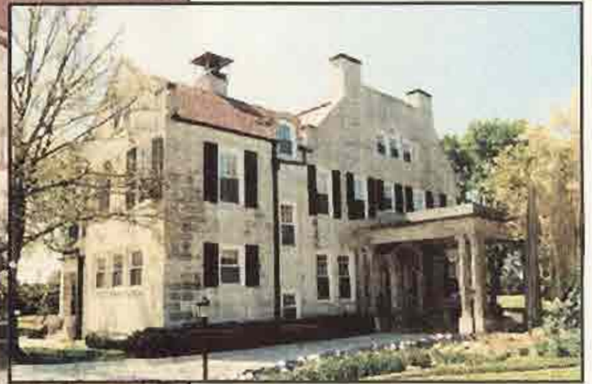
The Oklahoma Governor's Mansion.